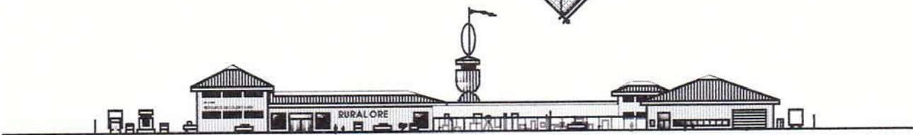
NORTH ELEVATION 1"=100'